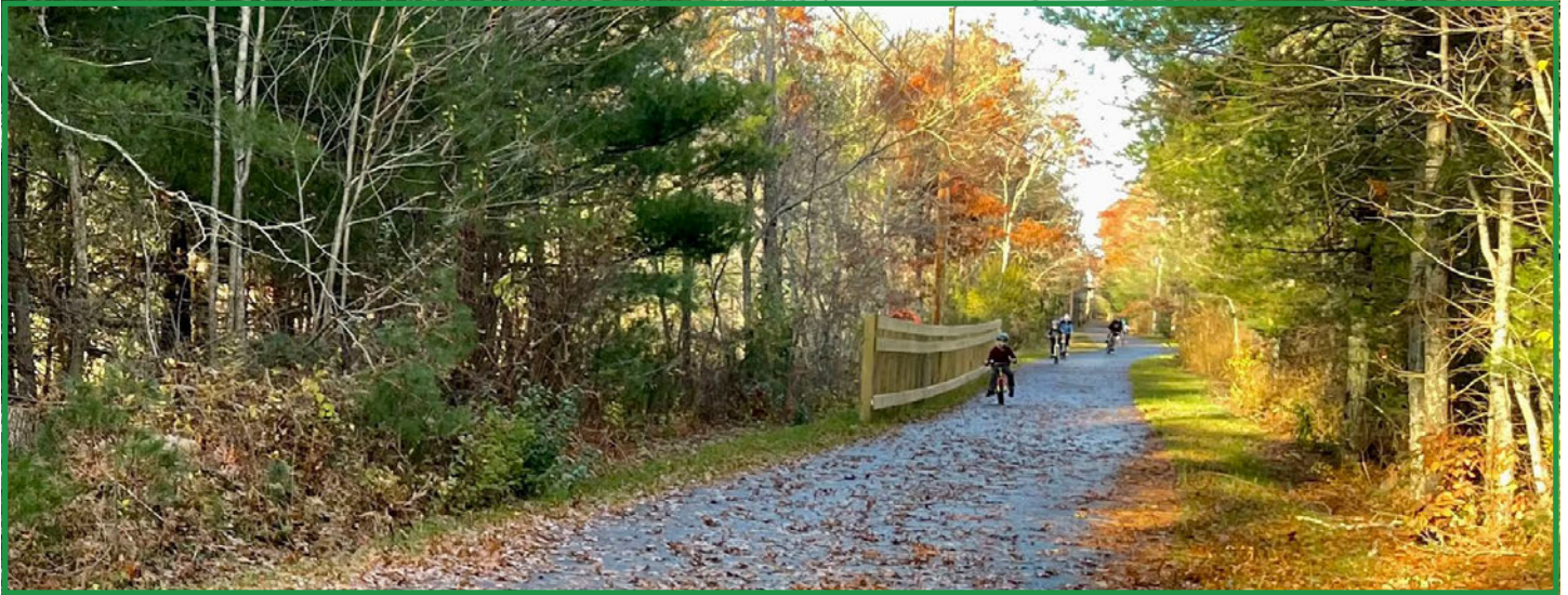
A family enjoying the new half mile Connector on a November afternoon.